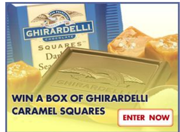
Sample Sweepstakes Banner Ad

Our publishers routinely engage their audience to respond positively to campaigns, special offers, discounts, coupons, etc. brought to our community by our sponsors.